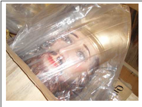
The image of Saint Boniface now in his permanent home at Saint Boniface Church.